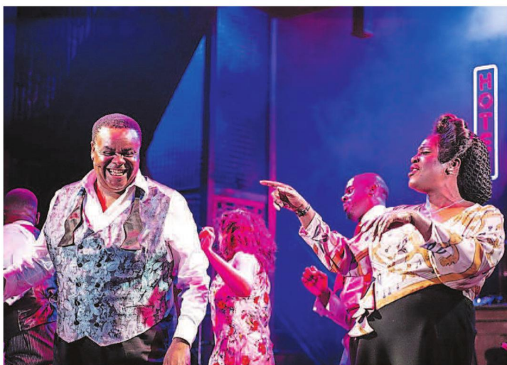
Clive Rowe and Sharon D Clarke in Blues in the Night