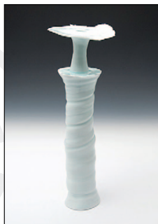
Takeshi Yasuda, Tall bottle , Qingbai porcelain, celadon, 39.0cm x 14.0cm, £1,920