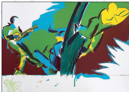
Allen Jones, Improvisation , Signed Lithograph, £1,200