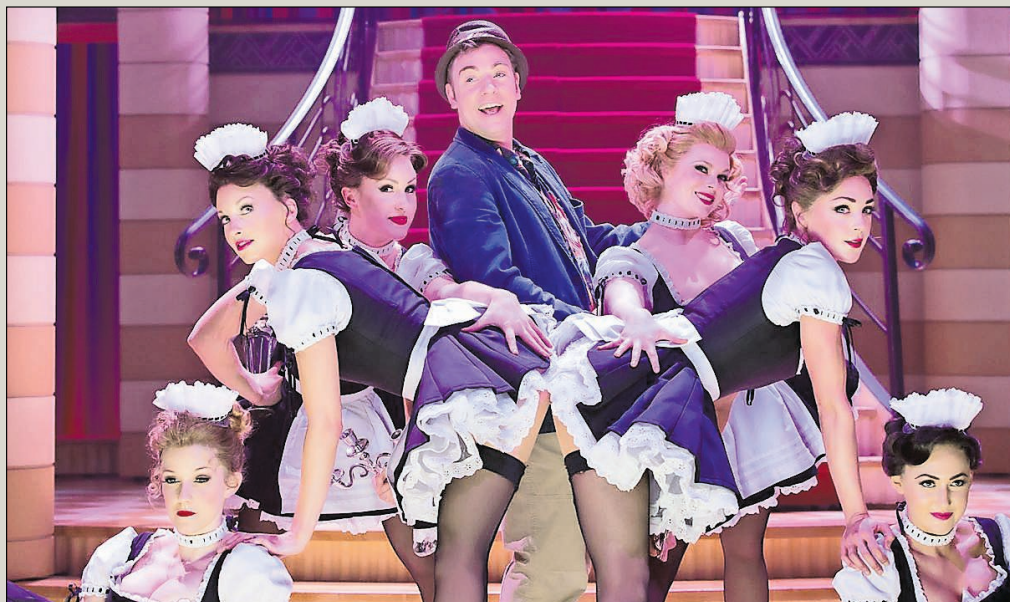
■ Rufus Hound stars in Dirty Rotten Scoundrels